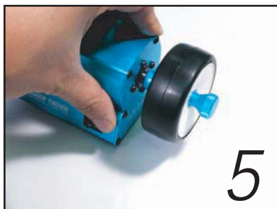
Hold the tire truer tightly with one hand then turn on the switch.