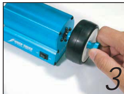
Tighten the hand screw gently but firmly by turning it clockwise.