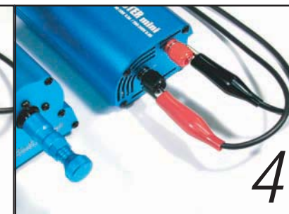
For counter clockwise (CCW) rotation, you should connect Red + clip to 12V power supply negative - connection and Black - clip to positive + connection.