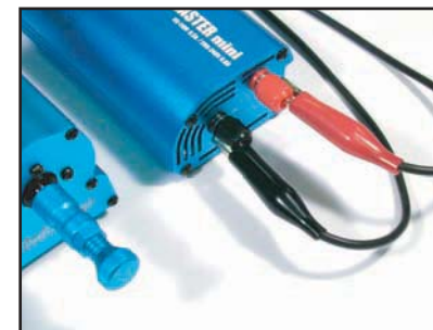
For clockwise (CW) rotation, you should connect Red + clip to 12V power supply positive + connection and Black - clip to negative - connection.