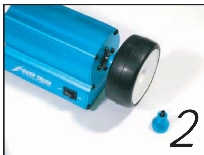
Fit a rubber tire into the tire truer. Make sure the instant glue is dried out completely before use.