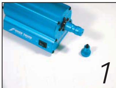
Disconnect the hand screw.

Important: Before using this product, please read all instructions carefully making note of all safety instructions, warnings and cautions. This product should only be used for its intended purpose and failure to do so may cause damage and/or personal injury and will invalidate the warranty of the product.